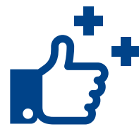
Positive value / attitudes