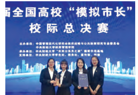
National Mock Mayor Competition (Beijing, China)