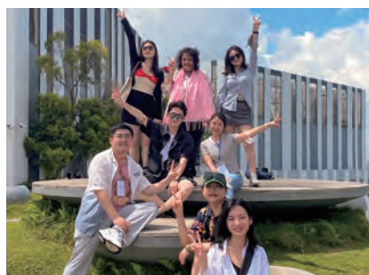
Site visit: Public Housing Estates in Singapore