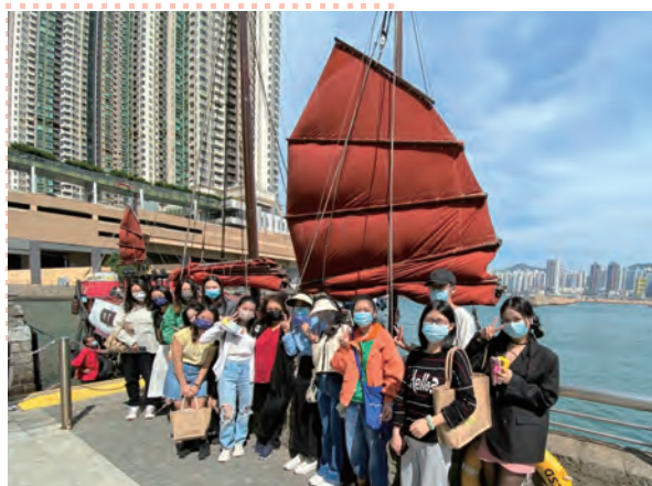
Cultural tour - Dukling Harbour Tour