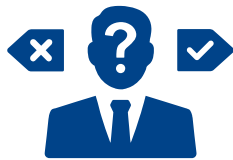
Ethical decision making