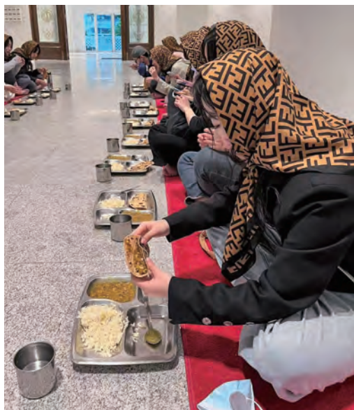
Community Visit - Sikh Temple

The MPPM also organises different hands on learning activities.