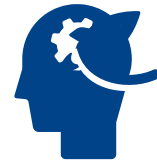
Creative thinking skills