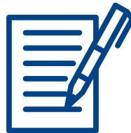
Written communication skills