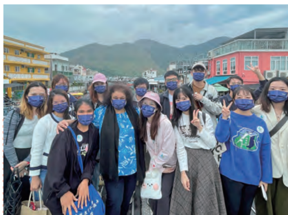
Ecotour - Tai O