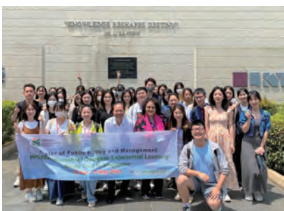
Attending classes at the Lee Kuan Yew School of Public Policy, National University of Singapore

Various experiential learning activities are organised in MPPM programme. For example, students visited Singapore and Qingdao in 2022/23