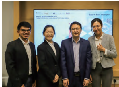
HKUST Inter-University Public Policy Case Competition