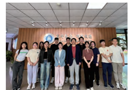
Experiential learning activity: Qingdao