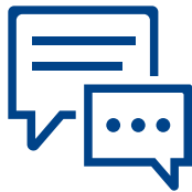
Oral communication skills