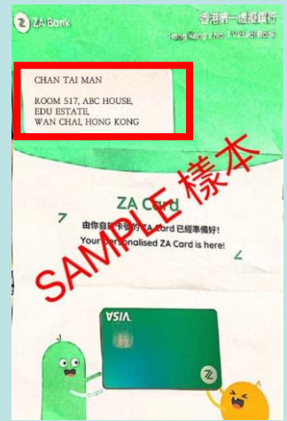
Address shown on the envelope