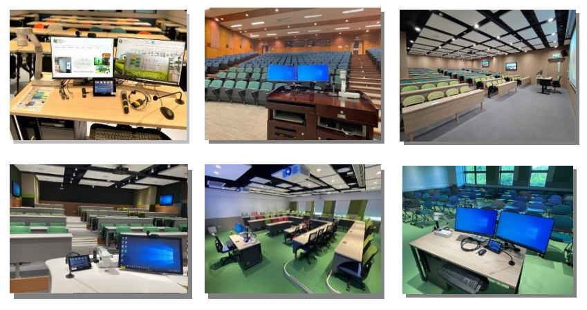
All these teaching venues are installed with Smartcard classroom control system. For more details, please visit the OCIO website.

All lecture theatres and general classrooms are equipped with networkconnected multimedia PCs, common audio-visual equipment, LCD projector and laptop connection ports. Teaching staff can conduct multimedia presentation in these rooms without the hassles of setting up equipment on the spot. When necessary, users can also use their own notebooks with the audiovisual equipment, providing a very flexible and convenient environment for integrating IT into learning and teaching.