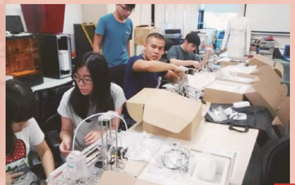
▲ Students trying out equipment during a 3D printer company visit. 7