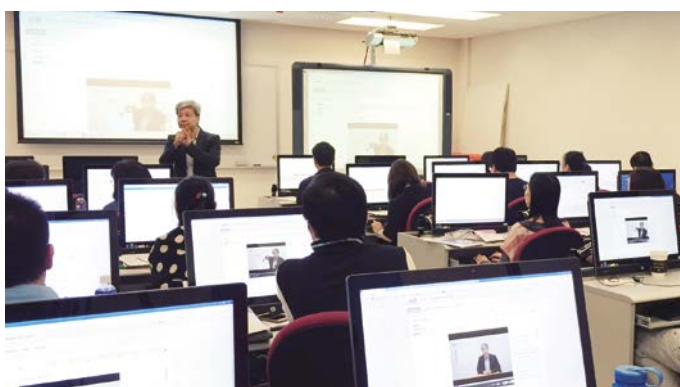
▲ Interaction of in-service teachers with a MOOC