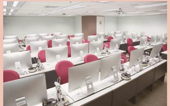
▲ Computer laboratory with 3D printers