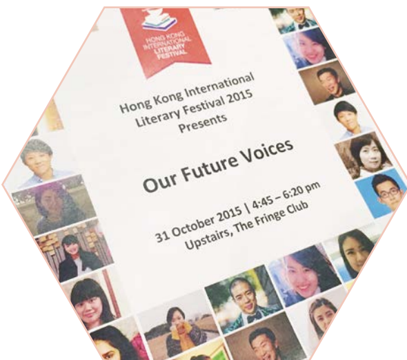
▲ Six students who contributed their creative works to the online literary journal participated and read to the public at the Hong Kong International Literary Festival 2015.