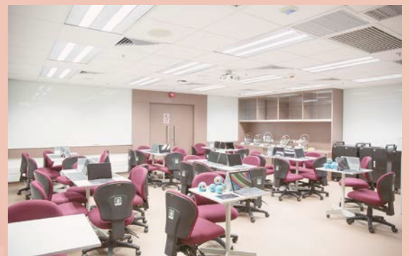
▲ Mobile computing laboratory