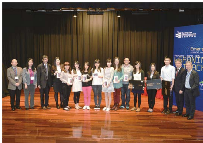
▲ Awardees of the Student ePortfolio Award 2015

To guide students in documenting, managing, and reflecting their own learning in 4/5 years of study, HKIEd has pioneered the launch of a campus-wide learning ePortfolio implementation since 2012/13. This project aims to nurture and empower engaged and reflective learners in monitoring and managing their own learning processes and outcomes. These learners will be able to set new learning goals and refine their learning process at different stages of life to become lifelong learners. LTTC is dedicated to providing continuous support to facilitate students' learning by creating their ePortfolios, ranging from briefings, workshops, to online self-learning materials. To encourage more students to create their ePortfolios, the Student ePortfolio Award was organized to recognize student excellence in 2014/15. The awarded ePortfolios demonstrated rich learning experiences with concrete personal goals, insightful viewpoints, and in-depth reflections.