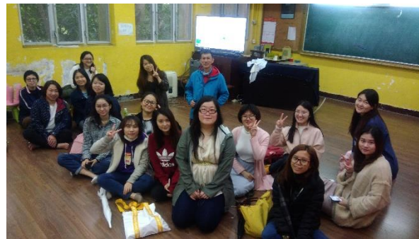
Alternative Education in a private primary school