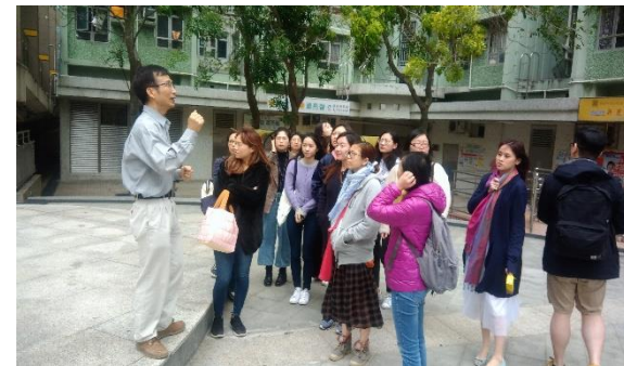
Intervention strategies in a community centre