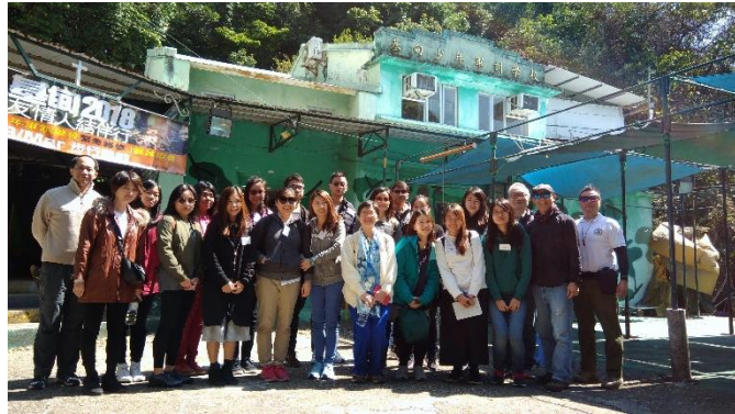
Adventure-based Counselling in an outdoor training centre