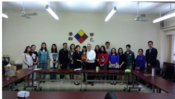
Guidance work in a mainstream primary school