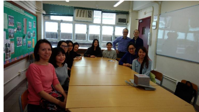
Role of an EP in a mainstream sec. school