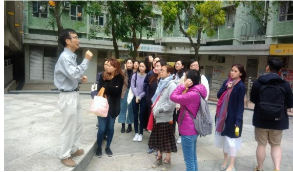
Intervention strategies in a community centre