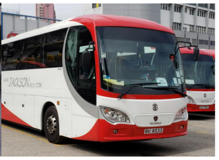
營運商巴士模樣 Outlook of the bus