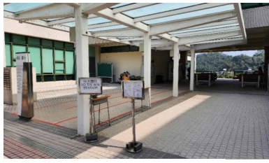
B1-B2 座之間上落客區 Block B1-B2 Boarding / Drop-off Area