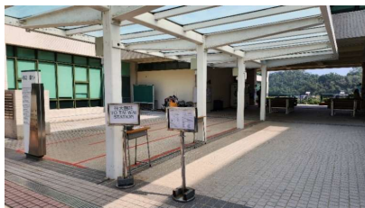
B1-B2 座之間上落客區 Block B1-B2 Boarding / Drop-off Area