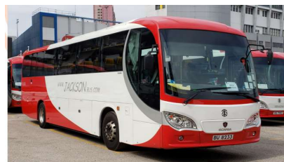
營運商巴士模樣 Outlook of the bus