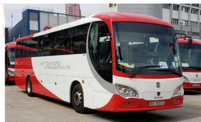
營運商巴士模樣 Outlook of the bus