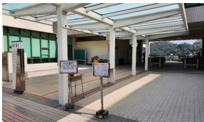
B1-B2 座之間上落客區 Block B1-B2 Boarding / Drop-off Area