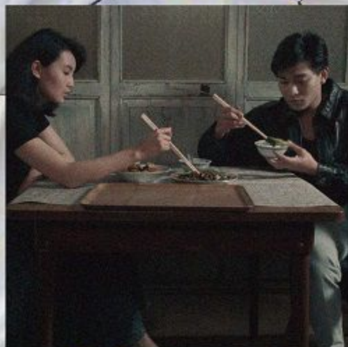
AS TEARS GO BY ↙ 1988