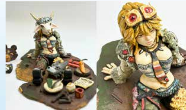
Leung Cheuk Lam, BA(CAC) Year 1 Little Adventure (2025) Ceramics