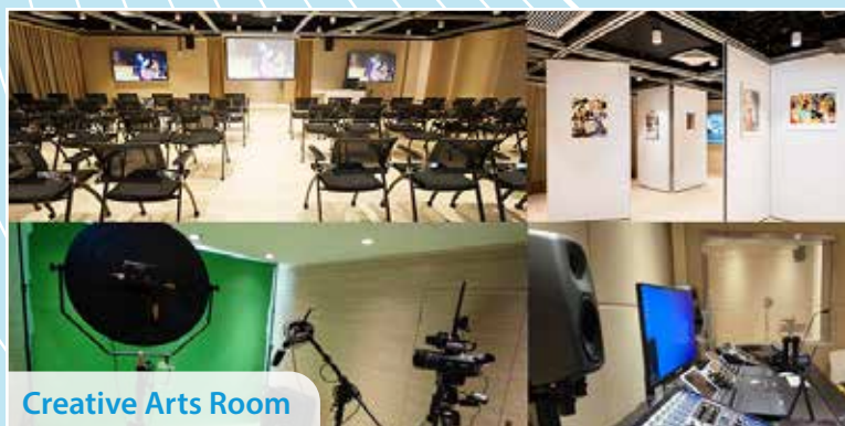
Creative Arts Room