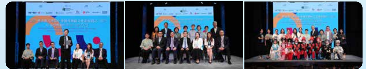
Advancing Chinese Traditional Culture in Greater Bay Area Schools – Symposium for Cantonese Opera Teaching 2025