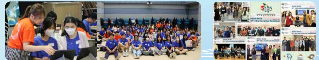
Music & Visual Arts Experience Summer Camp 2025