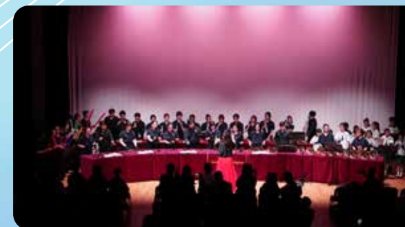
2025 EdUHK Handbell Ensemble Annual Performance: A Child at Heart