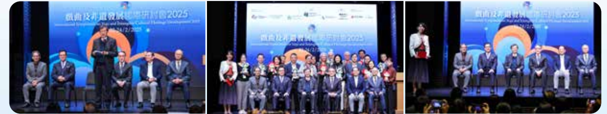
International Symposium on Xiqu and ICH Development 2025