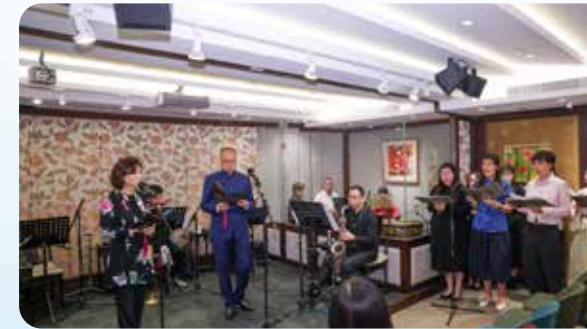
EdUHK Cantonese Operatic Singing Group Annual Performance 2025 粵韻留芳