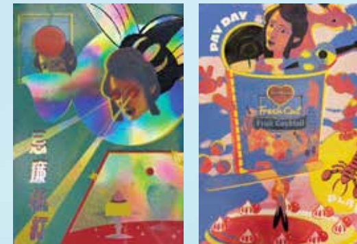
Deng Tsz Nga, BA(CAC) & BEd(VA) Year 2 Cream Soda(Left), Pay Day, Play Day(right) (2025) Silk screen on paper