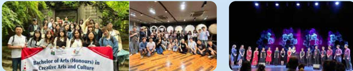
Regional Summer Institute