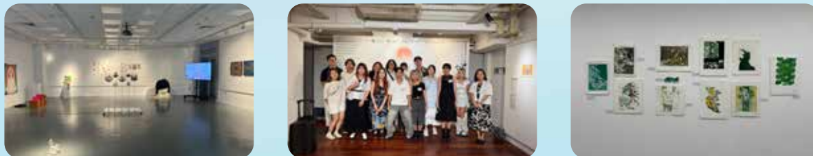
2024-25 MA(VAECF) Capstone Project Exhibition