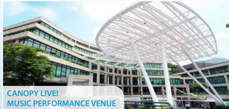
CANOPY LIVE! MUSIC PERFORMANCE VENUE