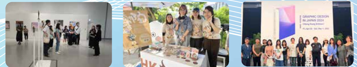
Hong Kong Art Week Exhibition Tour