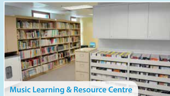
Music Learning & Resource Centre