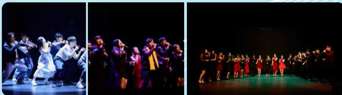
EdUHK Lacov Annual Performance 2025