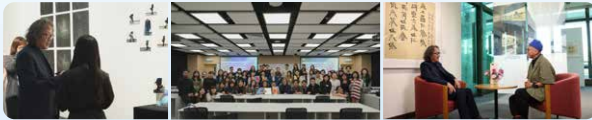
Visiting Professor XU Bing visiting MA(VAECF) Capstone Project Exhibition: Art Critique Session and Sharing