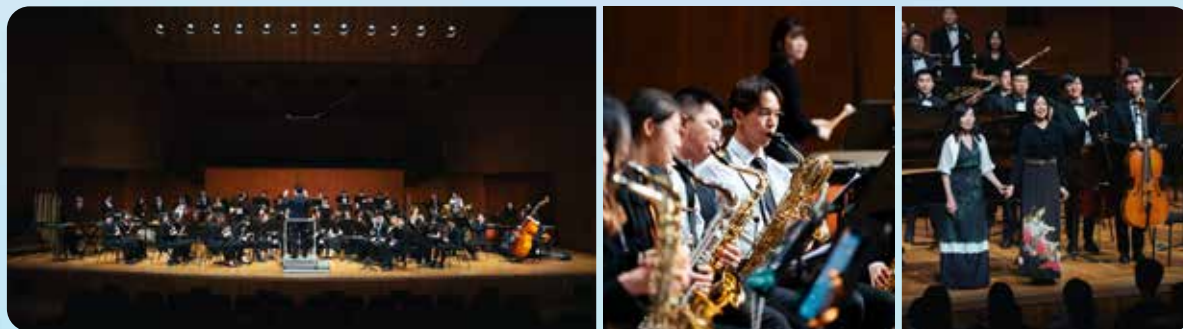
2025 EdUHK Joint Orchestras Gala Concert