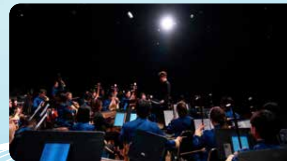
EdUHK Chinese Orchestra Annual Concert