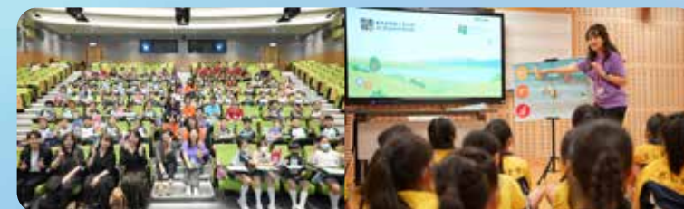
JC Project MuSE: Music for All EdU Fun Day