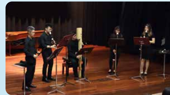
EdUHK EMR Annual Performance