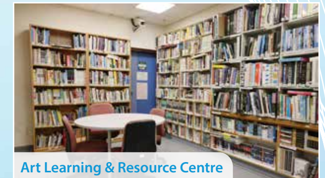
Art Learning & Resource Centre