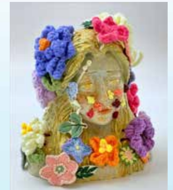
Ng Yee Ching, BA(CAC) & BEd(VA) Year 2 Untitled (2025) Ceramics, embroidery and crochet