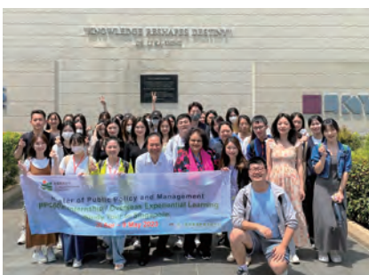
Attending classes at the Lee Kuan Yew School of Public Policy, National University of Singapore

Various experiential learning activities are organised in MPPM programme. For example, students visited Singapore and Qingdao in 2022/23.