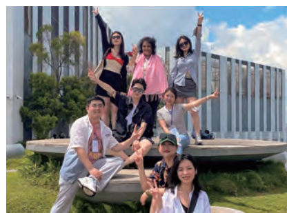
Site visit: Public Housing Estates in Singapore