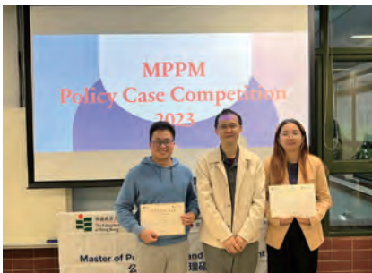
MPPM Policy Case Competition

Doctor of Social Science honoris causa , The Hang Seng University of Hong Kong